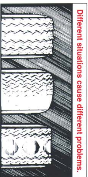
Different situations cause different problems.

will progress into larger, more costly repair bills. Many variables cause alignment problems. Most don't happen all at once so drivers may not notice problems as they develop.