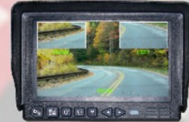
TRI SCREEN MODE