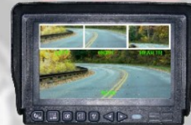
QUAD SCREEN MODE