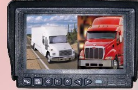
SPLIT SCREEN MODE