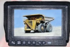
SINGLE CAM MODE