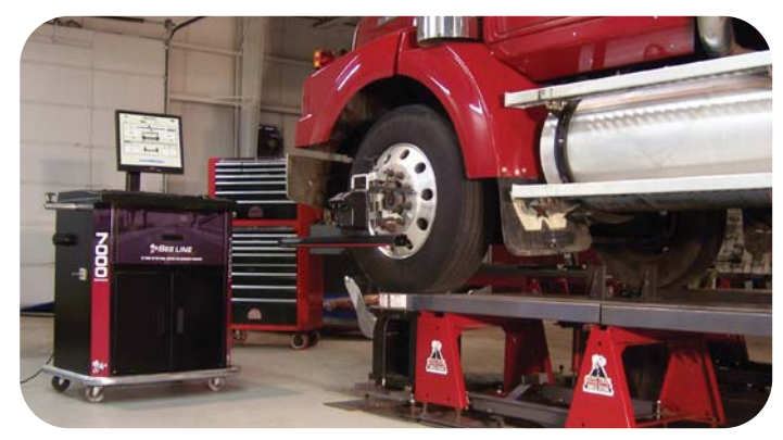
The LC7000 Series operates wirelessly and takes all alignment angle measurements. All Alignment angles can be repaired with Bee Line equipment. The LC7000 Series takes live measurements during repairs and displays them on the cabinet monitor or the optional EPM720 Remote Display to eliminate guesswork.

WindSpeed 7000 Alignment Software has the capability to assist beginners with pop up reminders, extensive help screens and help videos; while more experienced technicians have the option to customize their workflow to fit their skill level. When alignments are complete, detailed before and after color documents are printed for the customer. Comprehensive database management options give your shop the ability to save and recall any previous alignments.