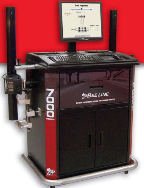
The newly designed LC7000 Series Cabinet charges heads vertically to save space.

The Bee Line LC7000 Series laser guided computer alignment gauging system is the new benchmark for the heavy duty truck alignment industry. Every aspect of this system builds on 85 years of alignment expertise and has been refined to make alignments easier, faster and more accurate than ever. Several innovative features make this the best heavy duty truck alignment system ever from Bee Line and by far the best system on the market today.