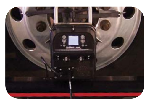
New interactive alignment heads are now a "workstation" for the technician.

advantage dramatically reduces the time to gauge the alignment of a vehicle. For additional speed and convenience, our heads also contain lasers that automatically seek out their target area on the opposite head. Lithium Ion batteries charge heads for up to 10 hours.