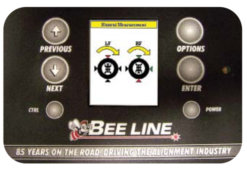
...the same step is displayed with live readings on the head!