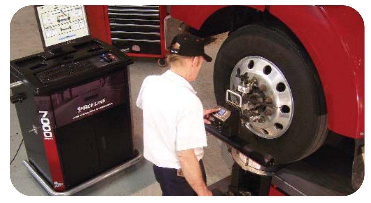
Alignment Technicians enjoy accuracy, efficiency and user friendliness.

The LC7000 continues the excellence of laser accurate measurements up to 1/1000th of an inch. The LC7000 instantly produces live measurements that are consistently repeatable. When making corrections, live readings serve as the guide to bring the vehicle into the optimum alignment position. Our alignment accuracy is so precise, we developed our own alignment specifications that align vehicles better than the O.E.M. specifications.