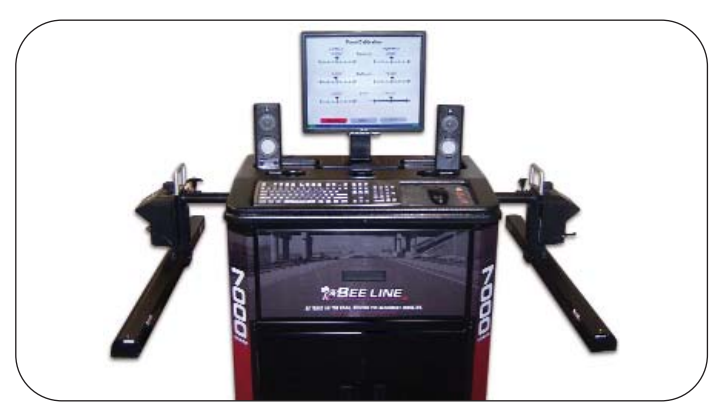
Alignment heads can be calibrated with the calibration fixture that is built in to every cabinet. Calibration process is a simple two step process that takes less than two minutes.