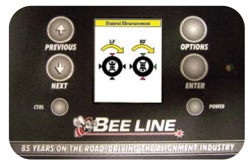
...the same step is displayed with live readings on the head!