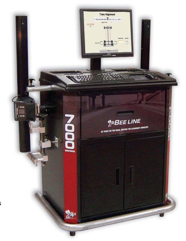
The sleek new LC7000 Series from Bee Line combines convenience with efficiency.

WindSpeed 7000 Alignment Software has the capability to assist beginners with pop up reminders, extensive help screens and help videos; while more experienced technicians have the option to customize their workflow to fit their skill level. When alignments are complete, detailed before and after color documents are printed for the customer. Comprehensive database management options give your shop the ability to save and recall any previous alignments.