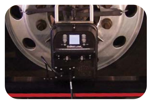
New interactive alignment heads are now a "workstation" for the technician.

advantage dramatically reduces the time to gauge the alignment of a vehicle. For additional speed and convenience, our heads also contain lasers that automatically seek out their target area on the opposite head. Lithium Ion batteries charge heads for up to 10 hours.