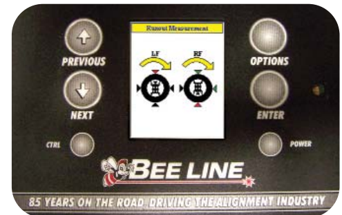
...the same step is displayed with live readings on the head!