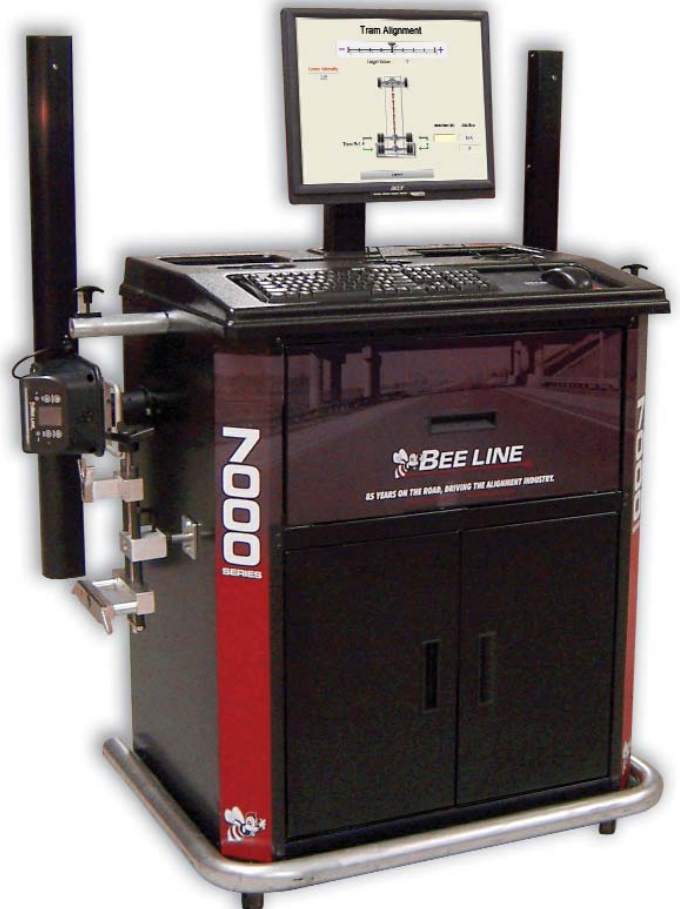
The sleek new LC7000 Series from Bee Line combines convenience with efficiency.

WindSpeed 7000 Alignment Software has the capability to assist beginners with pop up reminders, extensive help screens and help videos; while more experienced technicians have the option to customize their workflow to fit their skill level. When alignments are complete, detailed before and after color documents are printed for the customer. Comprehensive database management options give your shop the ability to save and recall any previous alignments.