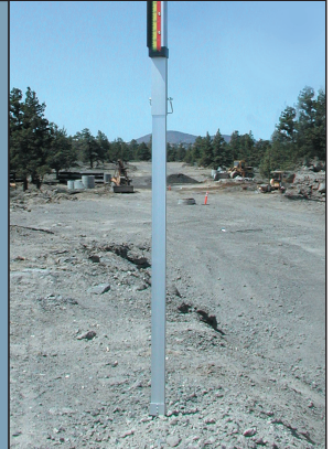
Image: shows rod extension fully extended to 4'