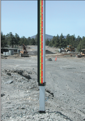
Image: shows rod extension fully collapsed