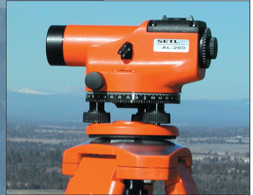
Level and tripod package shown