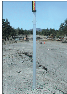
Rod extension fully extended to 4'