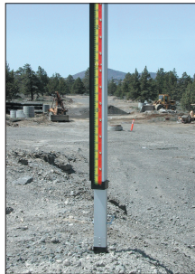
Rod extension fully collapsed

Allows you to extend the rod in one-foot increments up to four additional feet! 10-foot rods become 14-foot, and 15-foot rods become 19-foot.