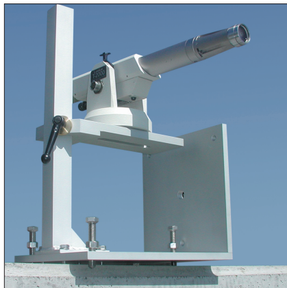
2000-10 Universal Tunnel Mount shown with T-2000 laser.