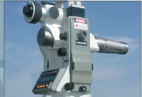
LR-2020D DIGITAL ELECTRONIC LASER THEODOLITE

FREQUENT APPLICATIONS TUNNELING MINING OFFSHORE DREDGING CONVEYOR ALIGNMENT CENTERLINE CONTROL