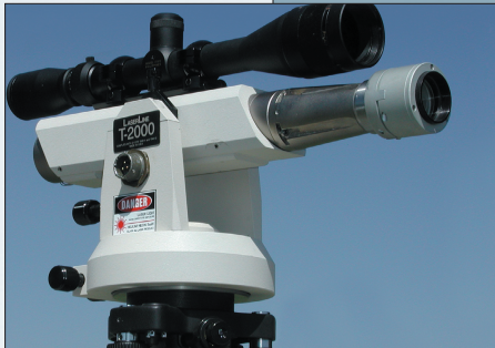
T-2000 SERIES LASER SYSTEM