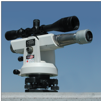
T-2000 shown with 2000-0525 Spotting Scope, 2000-0035 Fan Lens, 2000-0630 Optical Plummet Tribach, 2000-0620 Adapter