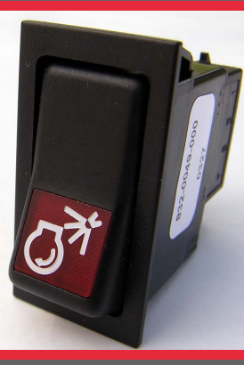
521 Series Rocker Switch