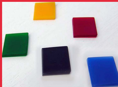
Standard Lens Colors