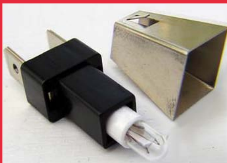
Optional Lamp and Diffuser