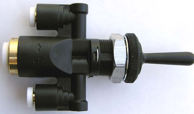
Pneumatic Toggle Valve