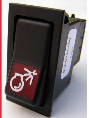
511 Series Rocker Switch

Basic Rocker Switch configurations are available with several options to meet most customer's requirements. Lighting options are: no lamp, general lighting (without diffuser), locating lighting (solid diffuser), or locating & function lighting (window diffuser). Other accessories include; Mounting Frames, Transparent Protective Covers, Connector Housings and Crimp Terminals. Pilot Lamp assemblies are available with or without lamp reflectors. Switch assemblies are most commonly ordered with the desired lens/symbol inserted, but the customer can do this installation by simply snapping the lens into the rocker. Lenses are available with symbols rotated in any of four orientations and in five standard colors. Lenses fit product line 511 through 531 and icons are produced by silk-screen or hot-stamping. A wide variety of standard international lens symbols are illustrated in our Rocker Switch Lens catalog. Lenses for the 533 product line are laser etched into the rocker face. Customers may consult M.S. Foster & Associates, Inc. for engineering assistance, custom lens icon design, and standard lens availability. All specifications subject to change for the improvement of the product.