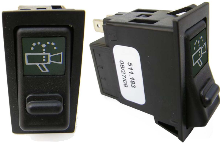
Electric Rocker Switch

Pneumatic Rocker Valve is available in illuminated and non-illuminated configurations, locking and non-locking, two position-three way and three position-three way, or momentary actuation.