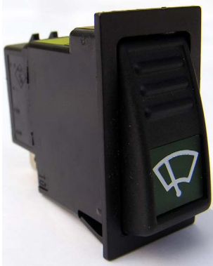
521 Series Rocker Switch