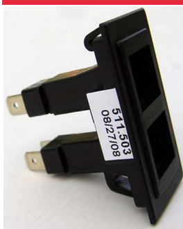
Pilot Lamp Assembly

Pneumatic Rocker Valve is available with push-to-connect pneumatic fittings for 1/8" and 1/4" nylon (DOT) tubing. Two position-three way valve is available with one-way 'lock-off' feature. Three position-three way valve is spring centered 'off' with momentary supply. Contact M.S. Foster & Associates, Inc. for application engineering assistance and product availability. All specifications subject to change for the improvement of the product.