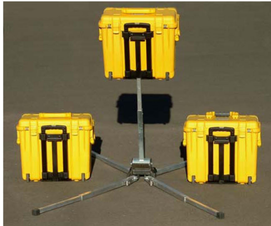
Photo 2. Safety Alarm Group