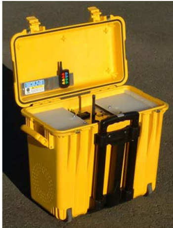
Photo 1. Safety Alarm