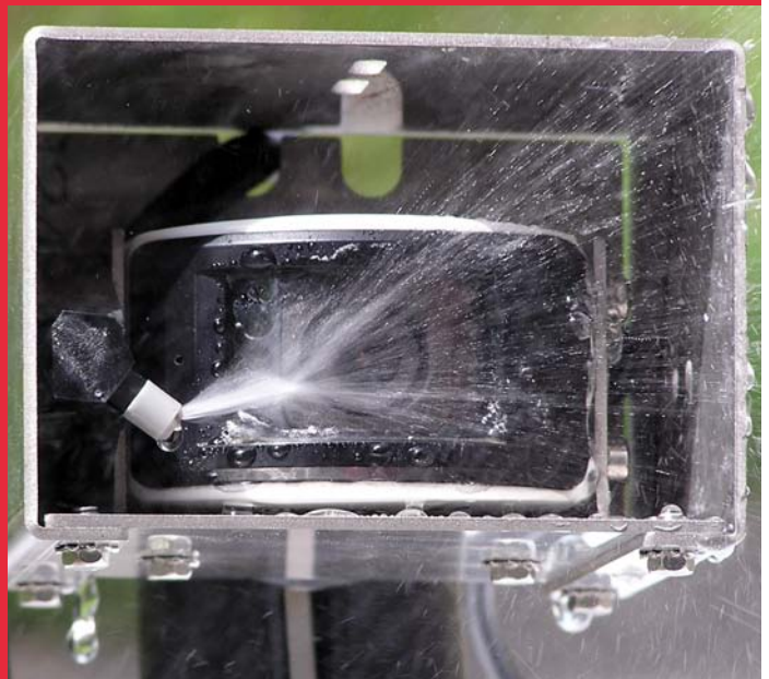
Optional Stainless Steel Box Shown. (Below)

(On Right) Available with 'U' Pivot Mounting Bracket (p/n MSF 5000 CAM 'U') or Adjustable Ram Mounting Bracket (p/n MSF 5001 Camera).