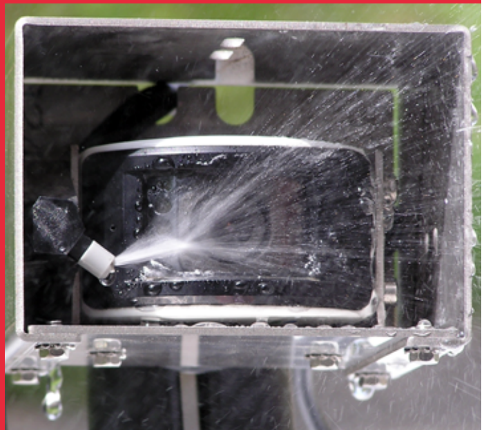
Optional Stainless Steel Box Shown. (Below)

(On Right) Available with 'U' Pivot Mounting Bracket (p/n MSF 5000 CAM 'U') or Adjustable Ram Mounting Bracket (p/n MSF 5001 Camera).