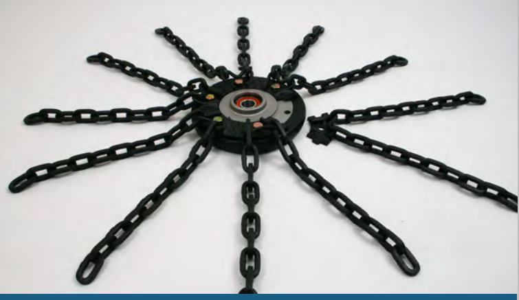
Upgrade to 12 Chains per wheel and receive traction at speeds as low as 3-4 mph (5-6.5 Km/h). They give smoother ride, and are great for starting and stopping on hills and tight turns.