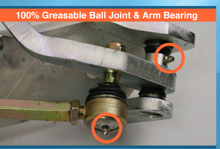
The Insta-Chain pivot points are 100% greaseable for longer life.