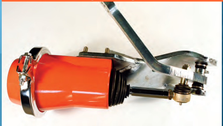
Powder coated air cylinders with chrome plated clamp & hex shaft provide insulation against corrosion. The tight sealing rubber boot prevents the ingress of road chemicals into the air cylinder.