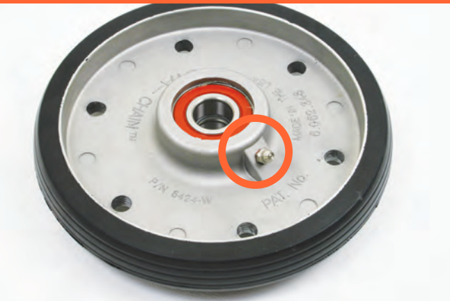
Greasable wheel bearings greatly extend wheel bearing life and saves costs