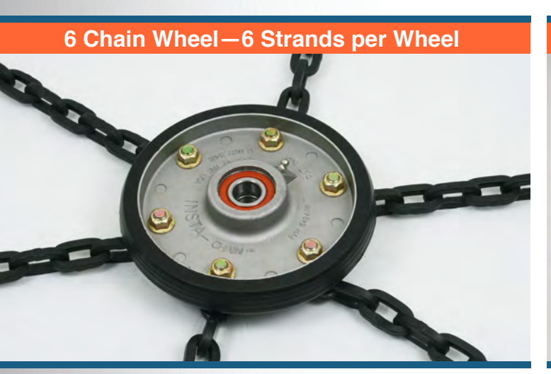
6 Chains per wheel is the standard wheel. They give you traction at speeds as low as 5-6 mph (8-9 Km/h)