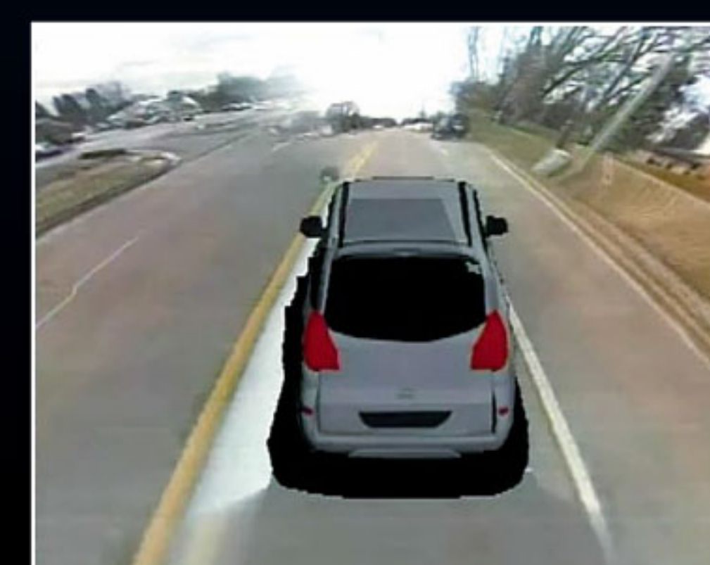
Front and rear generated views of your vehicle.