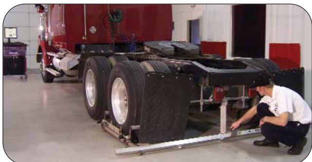
A laser is shot through a self centering target at the rear of the trailer or tractor...

The Bee Line method of trailer axle alignment and tractor rear axle alignment is simply the most accurate, fast, and user friendly method on the market today. The Bee Line Computerized Rear Axle Aligners combine the proven 21000 Rear Axle Aligner with the speed and convenience of a Bee Line LC7000 series computer. The result is the best of both worlds; extremely accurate rear axle alignments that align the wheels to the centerline of the chassis and live computerized readings that guide the technician to bring the axle into perfect alignment.