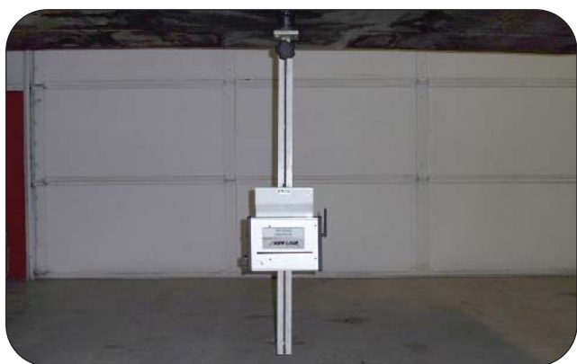
...to a self centered wireless electronic target at the front. In the picture above the target hangs from the trailer kingpin.