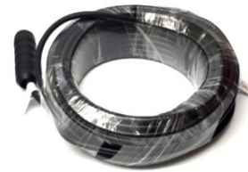
Display Cable— 39.37 ft.