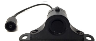
(4) Flange-Mount Sensors