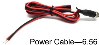
Power Cable—6.56 ft.