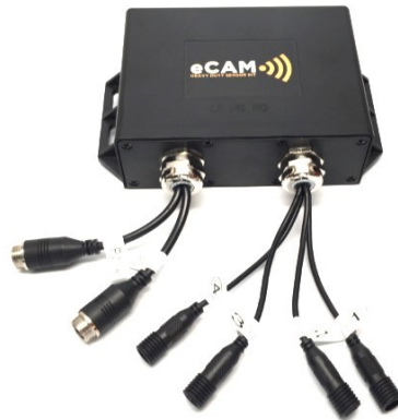
Main Control Box