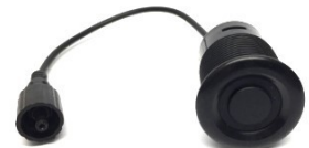
(4) Flush-Mount Sensors