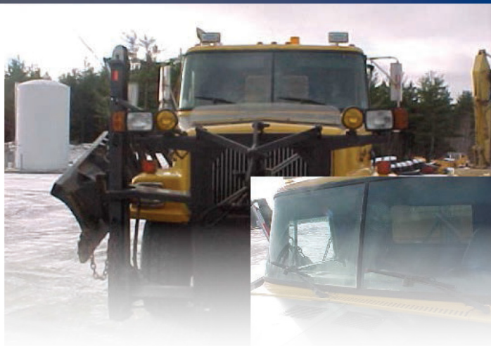
As installed on a Nova Scotia DOT Plow