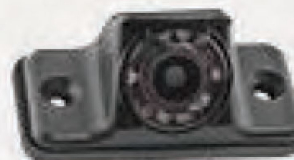
VCMS140iB (Sold separately)