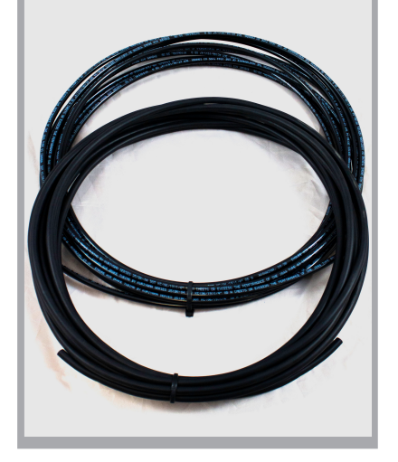
Tubing kits are available in 30', 50' & custom lengths