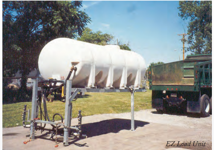
EZ Load Unit