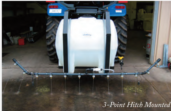
3-Point Hitch Mounted