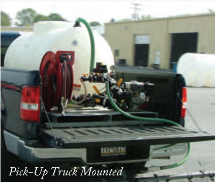
Pick-Up Truck Mounted