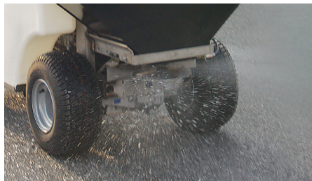
Spreading granular de-icing chemicals