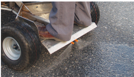
Anti-icing before event