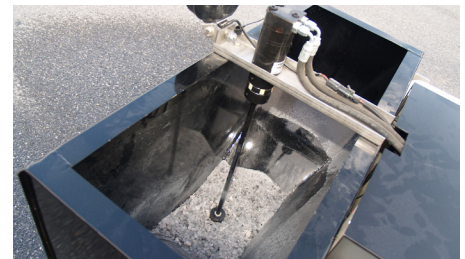
Granular salt bin