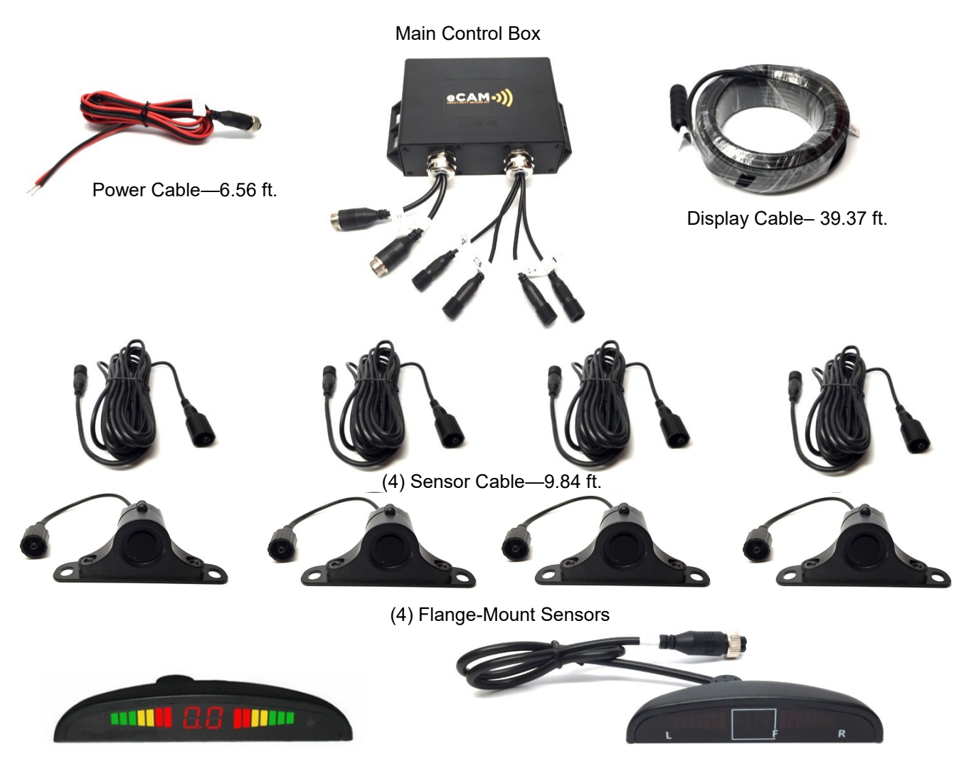
LED Display- Active